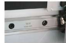
THK high-precision mute rail