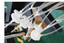
The automatic cleaning assembly adds a single-way valve to increase the stability of the ink supply