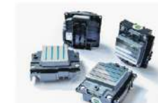
Equipped with 4pcs authorized I3200-E1 print heads,high precision, high speed, high stability.