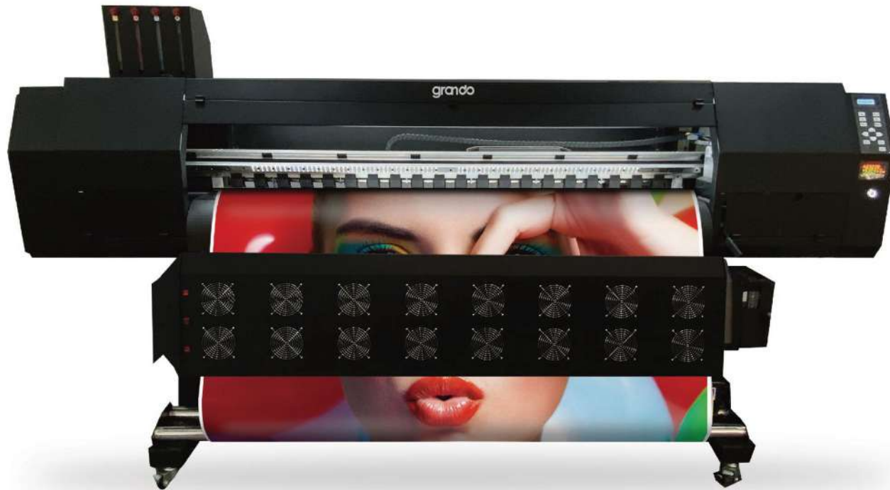
Four I3200-E1 Heads

Eco Solvent Printer (with four I3200-E1 heads)