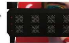
Three stage heating system including pre-heater, print heater, and rear heater and platform vacuum system with adjustable power.