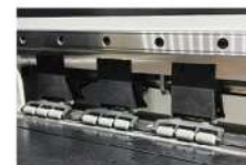
New pinch roller structure of three in group brings more stable feeding precision