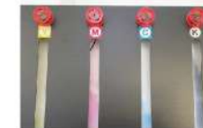
Bulky ink bottle with low-ink alarm represents the advanced vacuum concept of industrial application